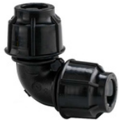
PP EQUAL ELBOW