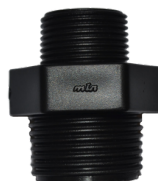
PP REDUCING NIPPLE