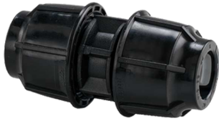
PP Union Coupling