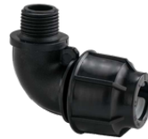
PP MALE ELBOW