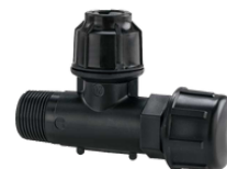
PP TAPPING FERRULE