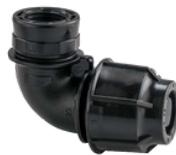
PP FEMALE ELBOW