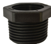
PP REDUCING BUSH