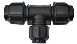
PP TEE REDUCER