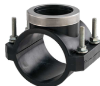
PP SADDLE CLAMP