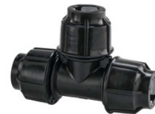
PP EQUAL TEE