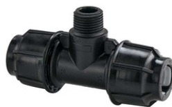
PP FEMALE TEE