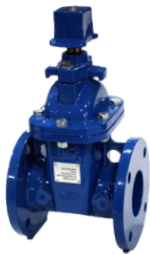
GATE VALVE (FLANGE TYPE)