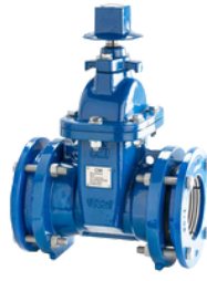
GATE VALVE WITH GRIP RING (MECHANICAL TYPE)