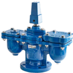
AIR RELEASE VALVE DOUBLE ORIFICE (FLANGE TYPE)