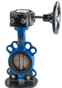
BUTTERFLY VALVE (GEAR OPERATED)