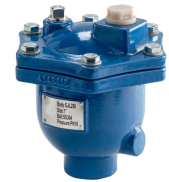
AIR RELEASE VALVE (FLANGE TYPE)