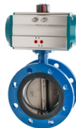
BUTTERFLY VALVE WITH ACTUATOR