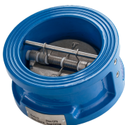
CHECK VALVE (WAFER TYPE)