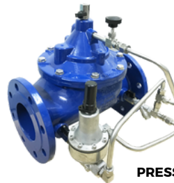
PRESSURE RELIEF VALVE/ PRESSURE RELEASE VALVE