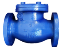
CHECK VALVE (SWING TYPE)