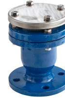
AIR RELEASE VALVE (FEMALE THREADED)