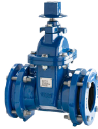
GATE VALVE (MECHANICAL TYPE)