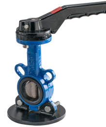
BUTTERFLY VALVE (LEVER TYPE)