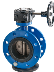
BUTTERFLY VALVE DOUBLE FLANGE (GEAR OPERATED)